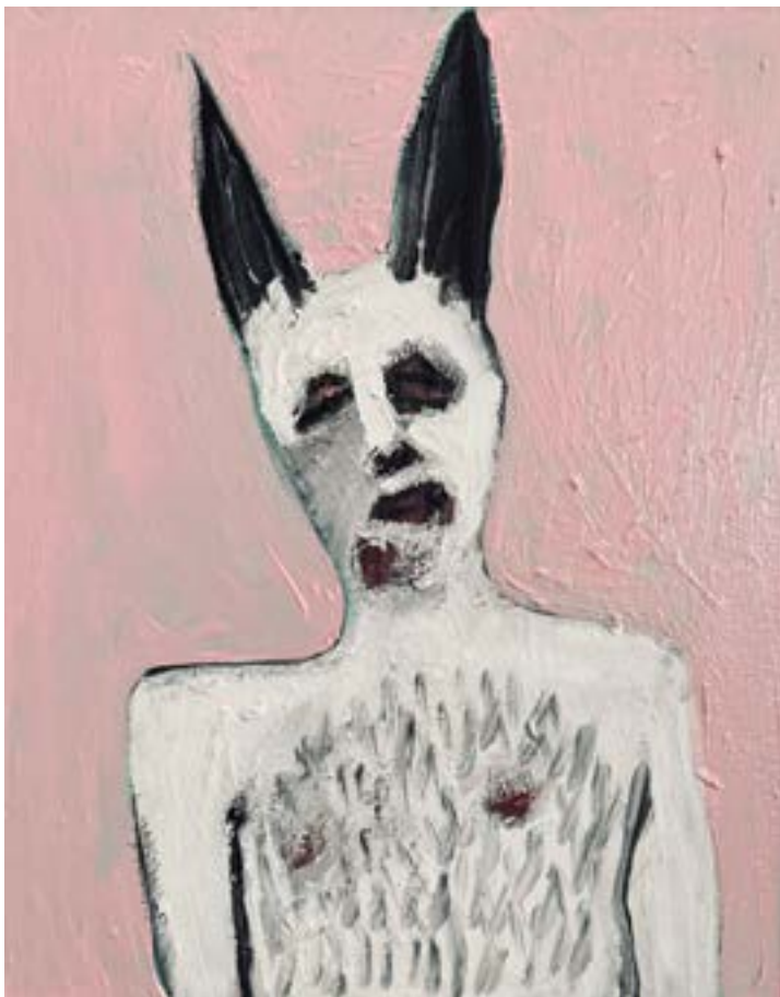
Trude Gunther 1 percent rabbit , 2023 Oil on canvas 54 x 44cm R14840