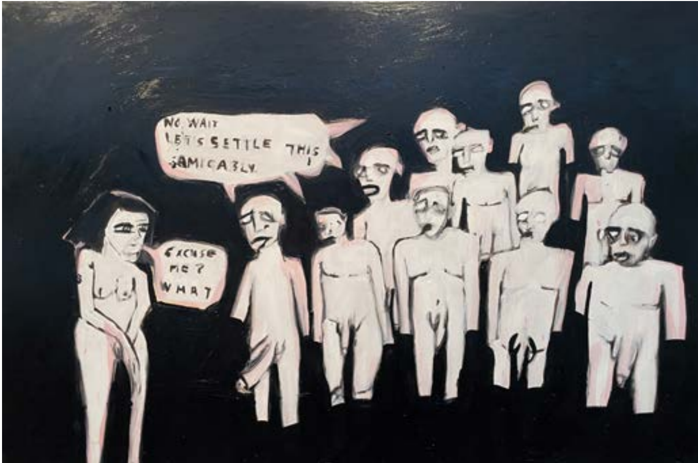
Trude Gunther 6112023 Apollos, 2023 Oil, charcoal, gesso on canvas 100 x 150cm R47700