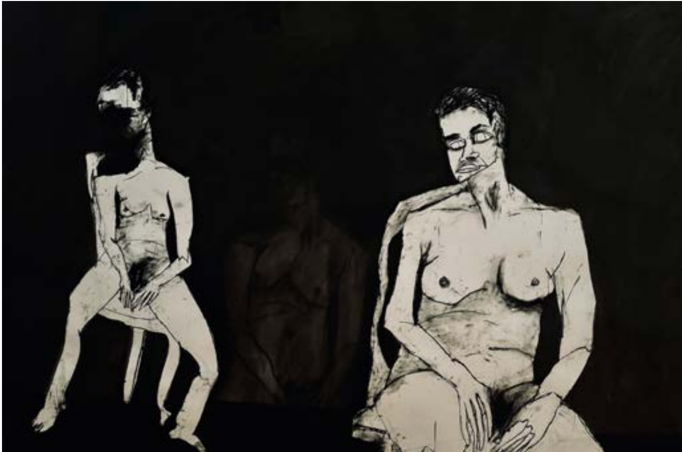
Trude Gunther girls' desire the same, 2023 Charcoal and ink on paper 62 x 78cm R47700