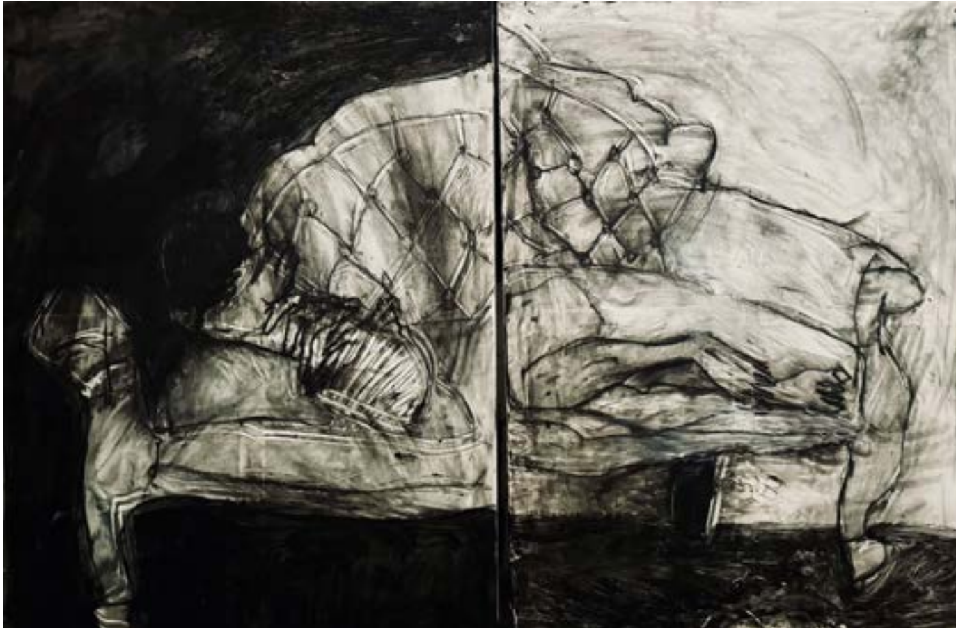
Trude Gunther 9112023 empty seats, 2023 Charcoal oil on canvas 101 x 152cm R23320