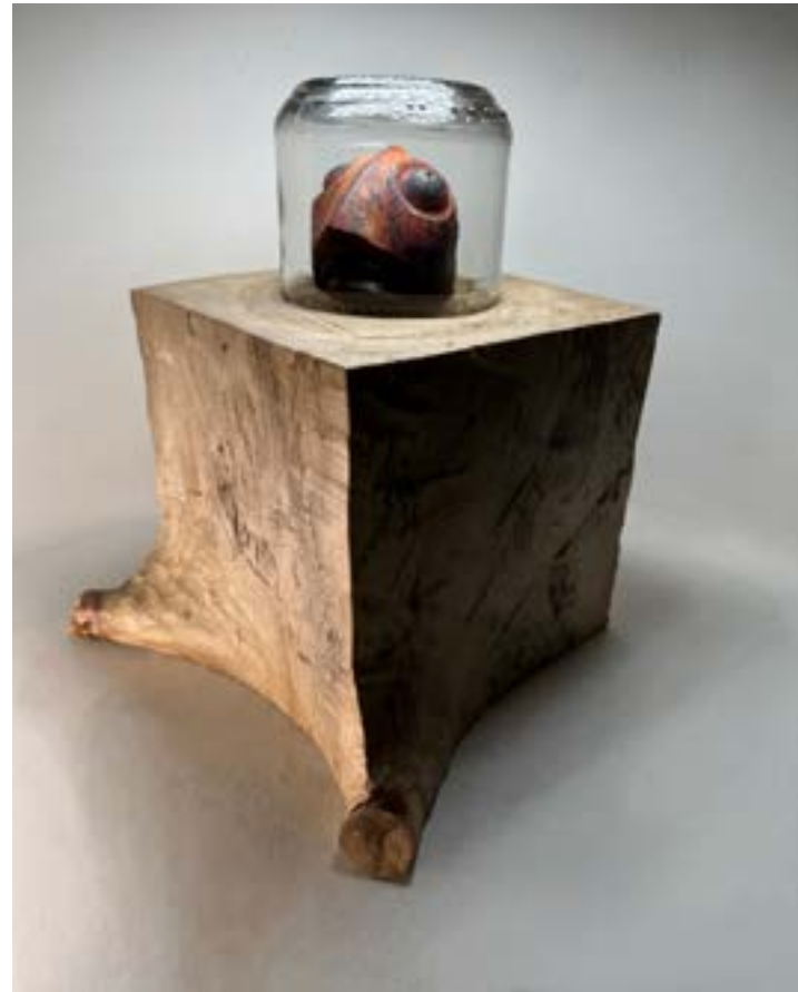
Stefan and Luke Carstens Oospore , 2024 Wood, glass jar, acrylic paint 26 x 12 x 16cm R16 960 (inc VAT)