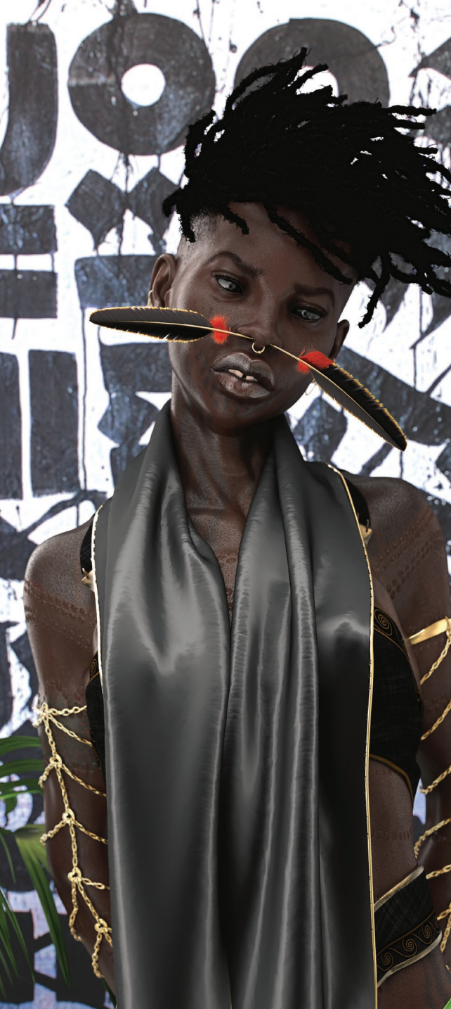
King Debs, Yo o kwa legodimong , Digital Print, Ed. 1/5, 2018, 74cm x 55cm (detail)