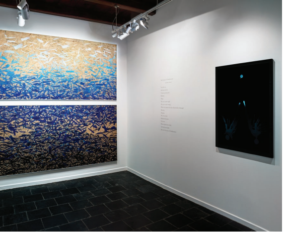
The Ocean of Limitlessness , solo exhibition by Abdus Salaam, 2019, Long Gallery

The AVA Gallery is made up of four gallery spaces, each with a distinctly different character. In addition, the outdoor stoep and salon room are used for events, residencies, mini exhibitions, workshops, talks, presentations, etc. The spaces can be hired for events and film shoots; please enquire via admin@ava.co.za .