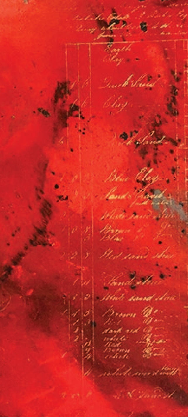
Jeannette Unite, MINE: Who Owns Africa , Mined materials, 2019, 30cm x 30cm (detail)