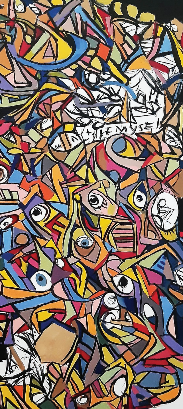
Byron Eksteen, Ghost DNA , Relief Ink on Canvas, 2019, 89cm x 71cm (detail)