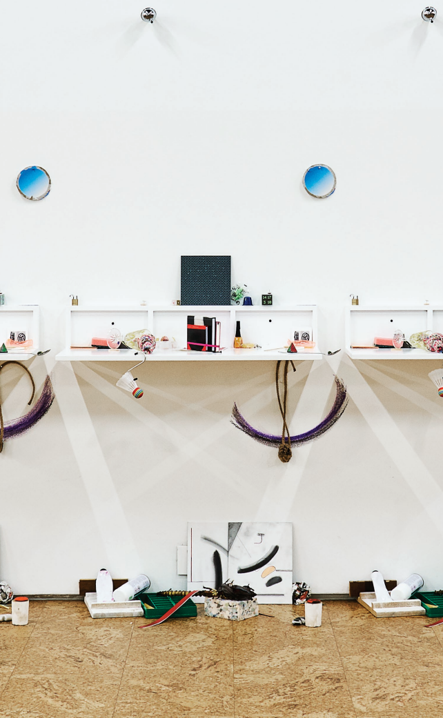
Christian Nerf, <3<3<3, Archive as Terrarium: Part 3 , Installation, 2019, Image courtesy of A4 Arts Foundation / Kyle Morland